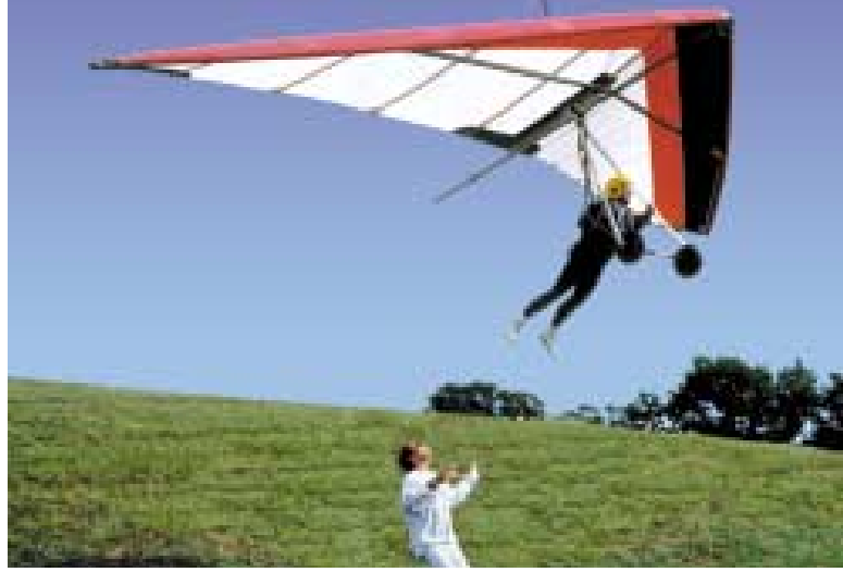
Beginners can solo over 100 yards without getting more than 10 feet off the ground...