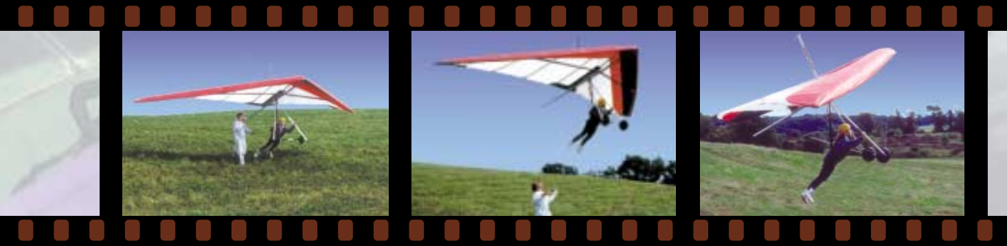
A beginner enjoys a low "ground skimming" flight just a few feet above the "bunny hill".

Come discover how much fun hang gliding can be!